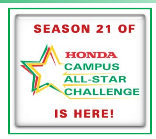
Schools must have their tournaments certified to qualify for the institutional grants.

An equally important part of Honda's unwavering commitment is to maintain the level of direct HBCU grant support while