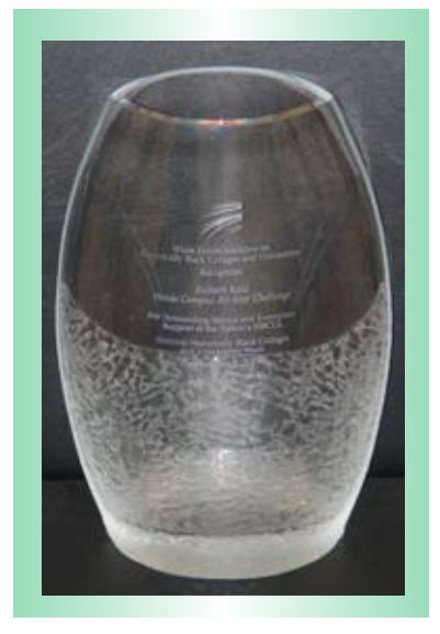
An engaved award was presented at a private luncheon for HBCU Presidents during the White House Initiative Weekend

This honorwould not have been possible without the presidents, staffs, volunteers and students of all the competing HBCUs. So truly, the entire HCASC family shares in this noteworthy accomplishment.