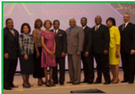
Ten HBCU presidents attended the banquet to recognize the performance of their students.