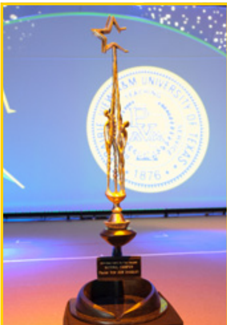
Prairie View A&M takes home this beautiful, one-of-a-kind trophy for their victory.