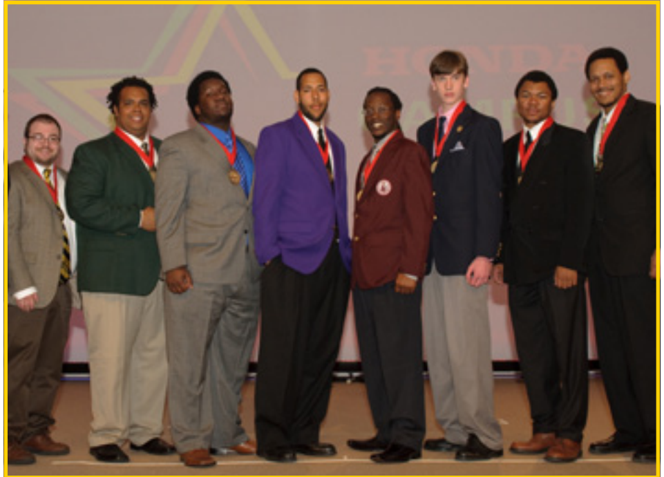
Presenting the leading scorers from the eight divisions. Each All-Star's institution receives an additional $1,000 grant from American Honda.