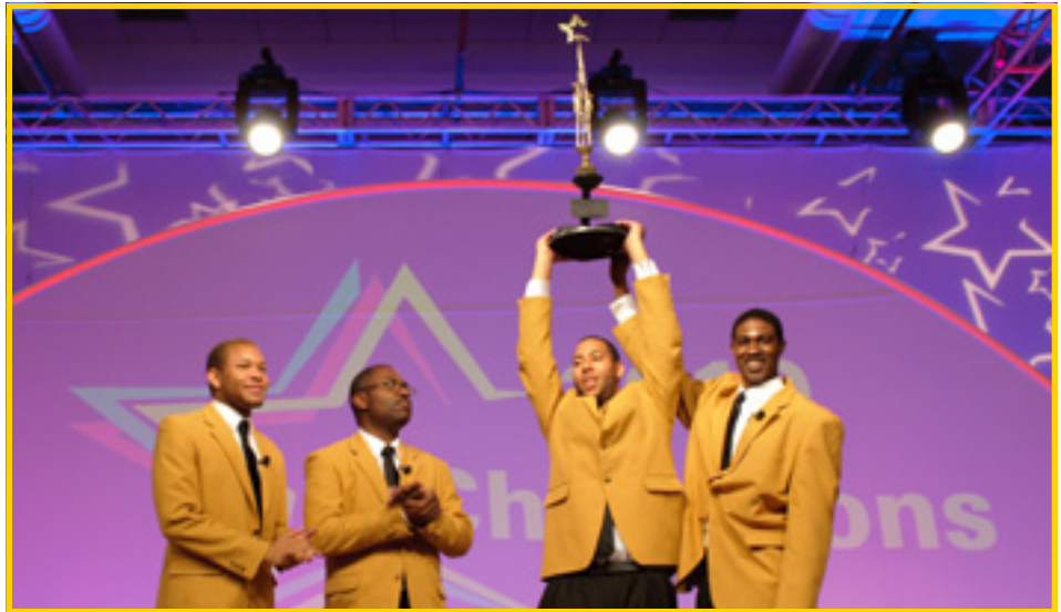
An elated Prairie View A&M team celebrates their first HCASC championship

As the lights in the ballroom were raised, this year's HCASC participants shared hugs, exchanged Blackberry PINs and vowed to keep in touch. HCASC 21 has definitely been one for the ages.