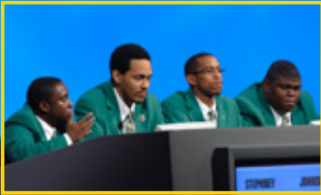
Mississippi Valley State listens intently during their final match with Prairie View A&M.