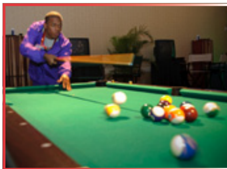
Paine College in the house and racking up points at the pool table.