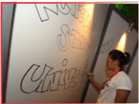
A Kentucky State scholar makes her mark on the Student Union graffiti wall.