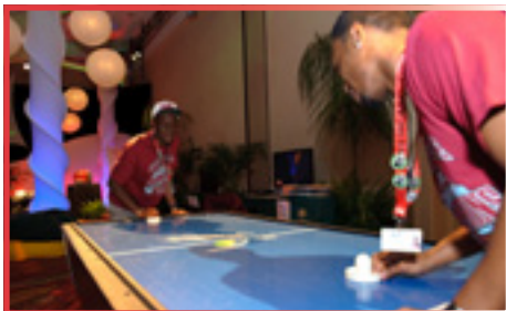
Air hockey is just one of the entertainment options in the Honda Expo/Student Union.