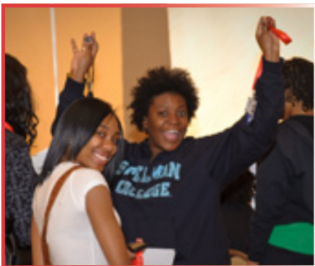
The ladies of Spelman College hit the scene with a new coach and a new attitude