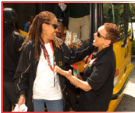
HCASC Volunteers celebrate the arrival of a busload of excited students!