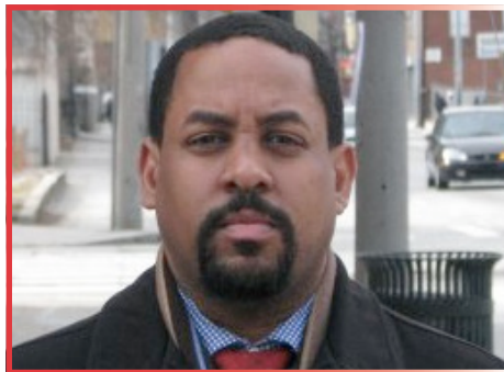
Behold, the Green & Gold Norfolk State University Spartans safe travels to Orlando and bring home the Gold. THIS IS SPARTA!!!