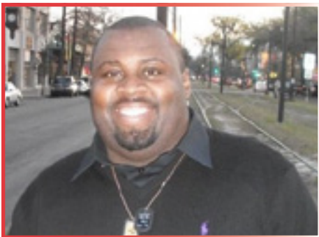
Play for Everything and Lose for Nothing...It is Winning Time...Go Braves of Alcorn State University...from the Big Homie lol