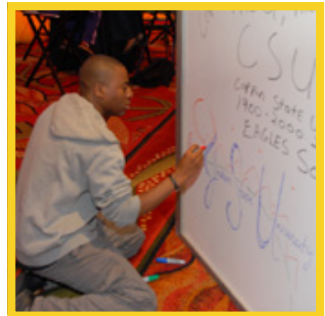
Post to your “wall” the old-fashioned way.

Students are always ready for a game of spades or bid whist to wind down after the competition. There are board games, music, and the ever popular graffiti wall where you can express your school pride with friendly messages.