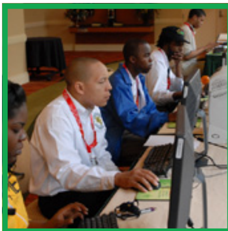
Need to e-mail the folks? Try the Cyber Café

Hungry? The Expo has a variety of light snacks to take the edge off your appetite (this year, meals are served in International South).