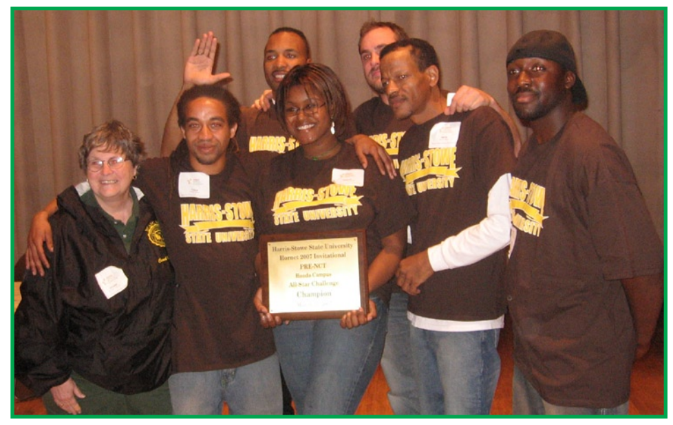
Attending Pre-NCTs improves game skills and allows the coach to observe Club members in a real world game setting.

Pre-NCT is the key. There is no better training for National Championship play than the Pre-NCTs. Coaches can tweak player line-ups and evaluate chemistry. Club members not on the Varsity Squad can look at the competition and observe other teams' strategies.