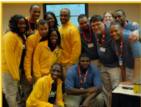
Medgar Evers and Tennessee State hug it out after the last round of Day One.