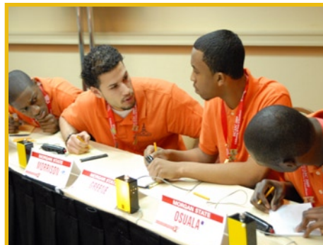
Morgan State confers on a bonus during a crucial match against Tuskegee.