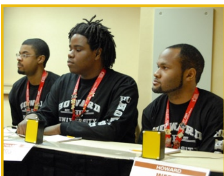
Howard faces off against an evenly matched Morehouse in an afternoon thriller.