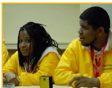
The reigning champs from Oakwood closed out their 7-0 winning streak yesterday.