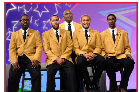
It's all smiles for Prairie View in the post-victory interview