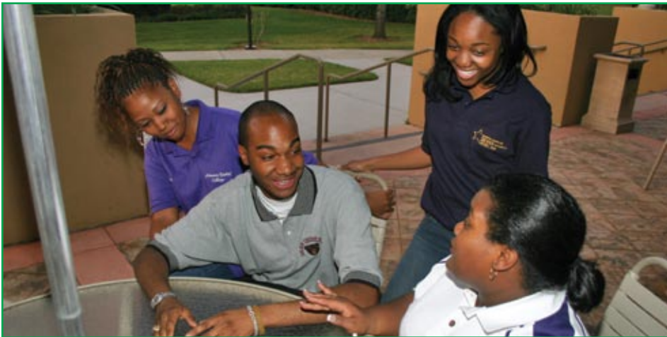
Camaraderie and friendship are part of the fun in an HCASC Club.

Typically, Coaches and Coordinators use the Campus Tournament as an evaluation tool to select teams for the Nationals. However, the most successful HCASC teams have embraced a different style of recruiting and training their teams, the “club” model.