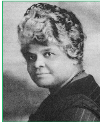
Ida B. Wells

state's constitutional convention and then was elected to the Georgia House of Representatives, representing Macon. In 1880 he won election as the twelfth bishop of the AME Church. Later in life, he became an outspoken advocate of back-to-Africa emigration.