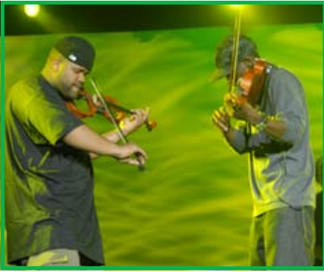
Violin virtuosos, Black Violin creatively inspired the Strong 64.