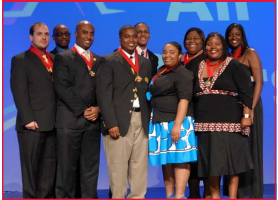
The 2008 HCASC All-Stars.