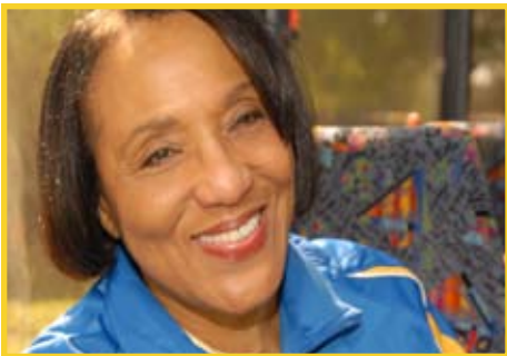
We love smiles here at Honda!