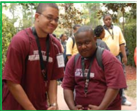
Don't hurt 'em UMES.