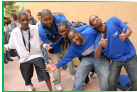
Fayetteville State can truly lean on each other!