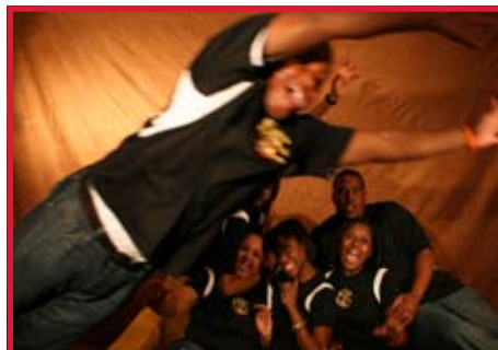
Up, Up and AWAY!!!!