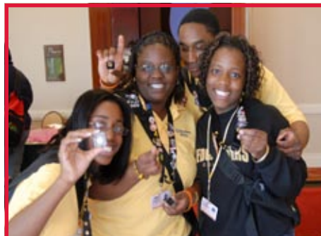
Show those pins Bowser division!