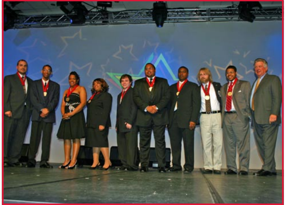
The 2007 All-Stars; the first ever All-Star team of nine, thanks to a tie in Turner.