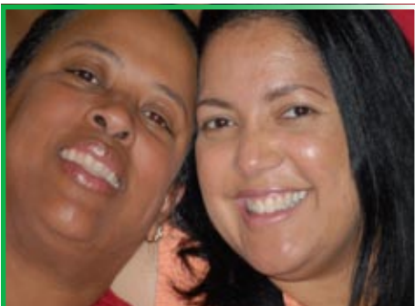
Friends for Life, and always crackin' jokes!