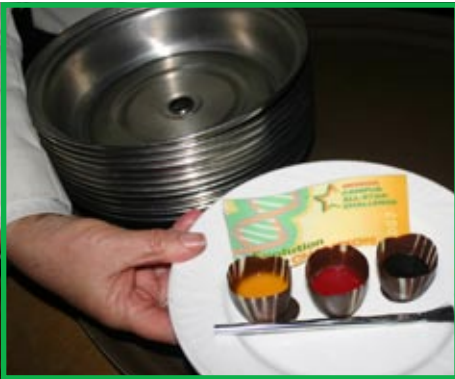
When was the last time you got a dessert with a paintbrush?