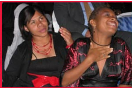
Swaying to the vocals of the Velvet Teddy Bear