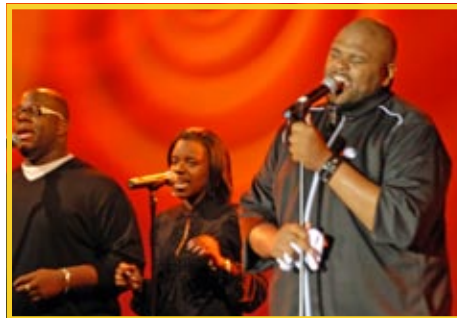
Ruben Studdard crooned songs from "The Return" for the HCASC class of 2007