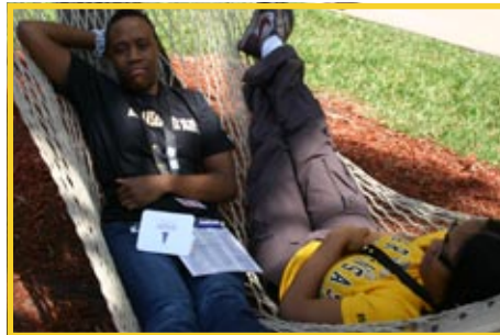
Sunny days in Orlando