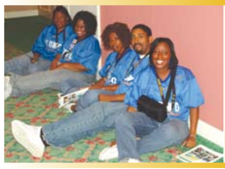
There's plenty of time for gameplay and relaxation during the tournament.

The journey that began with the campus tournament has led to Orlando. Now it is time to take the next step in the "Evolution of a Champion." Let the HCASC NCT begin!