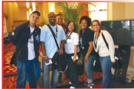
Welcome to HCASC 2007!

The first day of HCASC is always exciting, hectic, and fun. Here's an idea of what to expect: