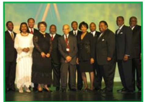
Presidents proudly supported their scholars at the gala Closing Banquet.