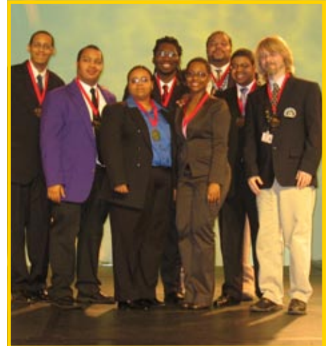
All-Stars received medallions for their outstanding efforts at the competition.

The 17th HCASC season brought a mixture of amazing gameplay, outstanding sportspersonship and exciting new experiences that exemplified the theme "Your Challenging Spirit."