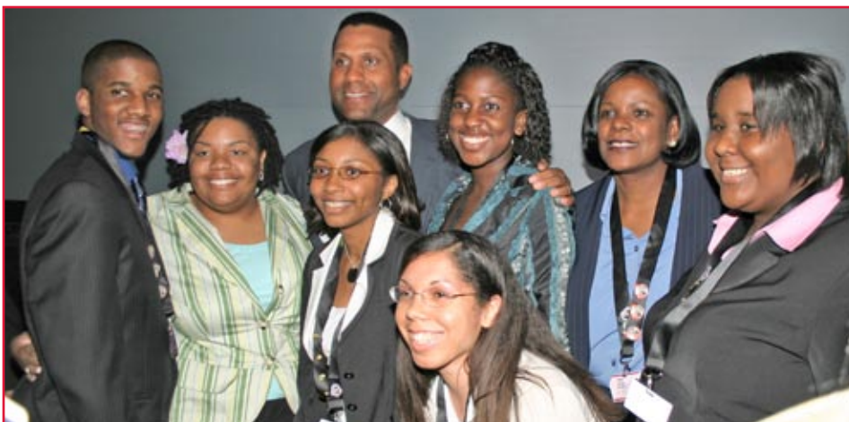
Radio and Television personality Tavis Smiley addressed the HCASC Opening Banquet. Smiley is seen here with students of Dillard University

Social and political commentator Tavis Smiley made a big splash at the 2006 HCASC opening banquet. Smiley shared remembrances of his college days, his career ups and downs and the responsibility of today's generation of leaders.