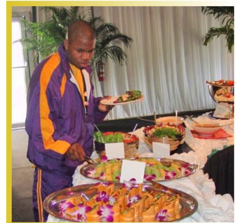
Breakfast and lunch are in the Student Union's "Food Court" this year

Whatever your pleasure, there's lots to enjoy in the Student Union & Honda Expo in the Pavilion.