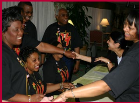
Friendly volunteers are here to help.

It's your first time at HCASC and you don't know what to do. Be cool! Arrival day can be hectic, but this quick guide will help to make it a snap.