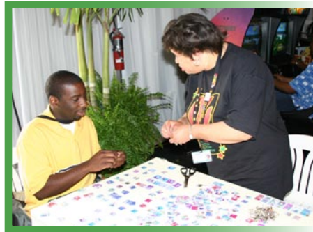
Making personalized pins to share is a great way to make new Friends for Life

And if you're hungry, the Student Union has the food and drink to recharge your body and spirit. This year, breakfast and lunch will be served in the Student Union "Food Court" so you can always pop down between games to grab a snack.