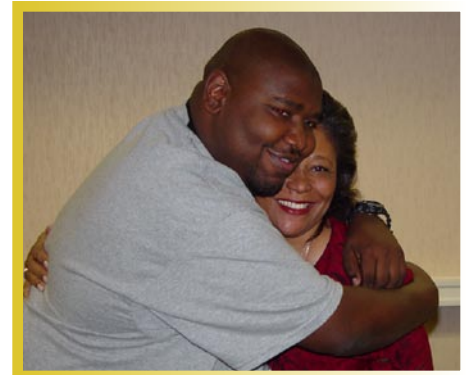
Make a new friend and have fun!

Of course, you'll want to keep in touch with your family and friends. So what could be easier than sending an e-