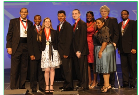
A tie in the Black Division resulted in nine All-Stars being named this year.