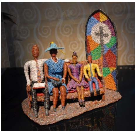
Each sculpture requires hours of painstaking effort to render the vivid slices of life.