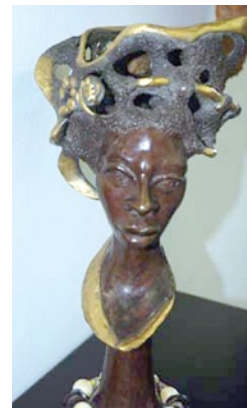
"Nita Fae", a bust in bronze by Charles Dickson