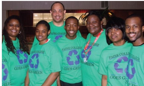
Paine College goes "Green"!