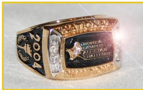
The 2004 Championship ring