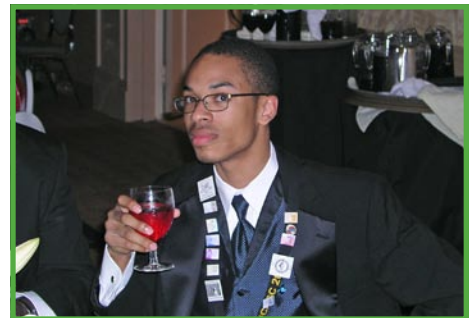
Cheers to you, HCASC!