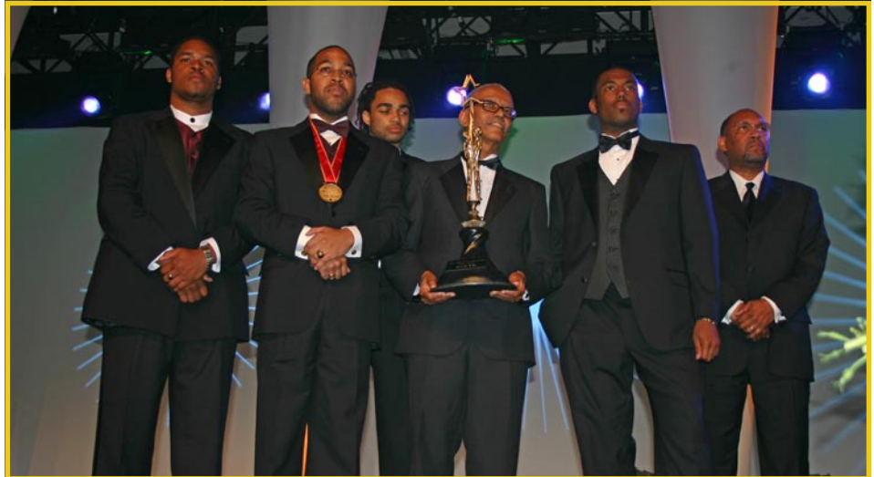
For the third time, the Maroon Tigers of Morehouse College were named champions of the national competition. Their three-round finale against Maryland Eastern Shore is sure to be remembered as one of the best in HCASC history.

The closing featured a video presentation of this year's national competition, from the arrival of the first team bus to the final rounds of this morning's championship game. En Vogue's performance was a surprise to many and a joy for all. Original members Cindy Herron and Terry Ellis introduced the crowd to newest En Vogue member Rhona Bennett, and wowed the crowd with their Funky Diva style, performing classic hits and singles from their newest album, Soul Flower .