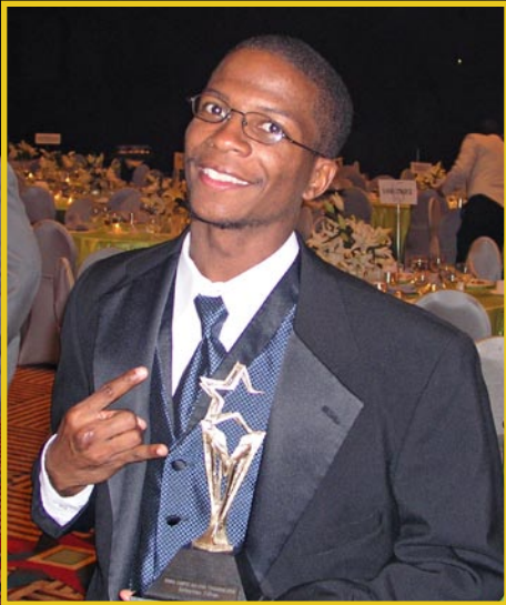
This HCASC competitor shows some winning spirit during the final ceremony.