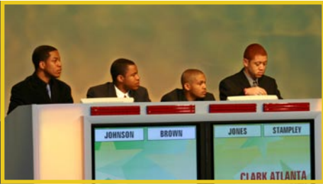
Clark Atlanta thinks hard during their semi-final match against Morehouse.