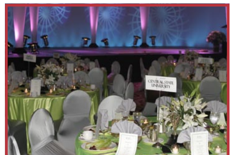
The banquet ballroom was resplendently decorated for the black tie affair.