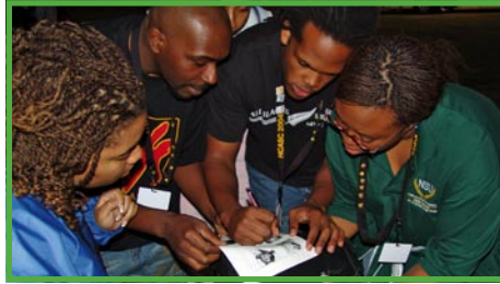
A Mad Fun team huddles to complete their task

The goal of Mad Fun was to develop a sense of teamwork and collaboration among HCASC participants. Mad Fun teams were randomly selected, affording students the opportunity to network with peers from different schools bringing Honda's "Reflections and Connections" vision alive! Both students and volunteers participated in the wild events and most will agree that this goal was definitely accomplished!