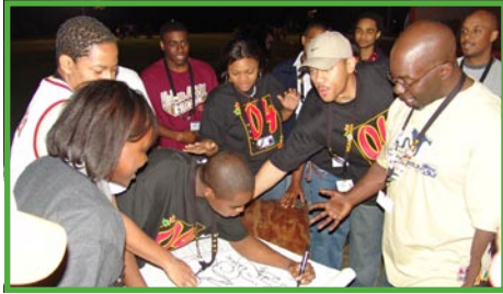
Blindfolded Pictionary was a crowd favorite

The HCASC team thanks you all for your participation and patience and wish you all the best of luck in the remaining days' competitions. Winners of the Mad Fun competition will be announced today, so keep your eyes and ears open!