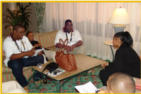
Bethune-Cookman takes a well-deserved break between rounds.

Morehouse College has been the most impressive team in the field, amassing 1,770 points in four games in the Scott Joplin Room. Other undefeated teams include Alabama State, Maryland-Eastern Shore, and Elizabeth City State.