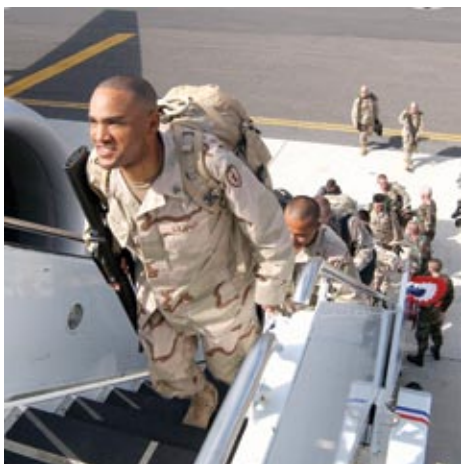
Troops departing for service overseas

American soldiers serving around the world protect the ideals of democracy with pride and honor.