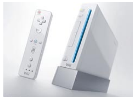
Can you pick the right case and win a Wii? Be there for HCASC Deal or No Deal