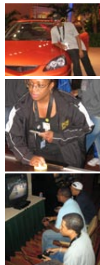
Scenes and highlights from HCASC's Student Union & Honda Expo

The HCASC Student Union & Honda Expo are highlights of the Honda Campus All-Star Challenge NCT. Returning players look forward to seeing what's new in the Expo, while newcomers are often amazed at the set-up of the Palm Ballroom and the vast amount of fun activities inside.