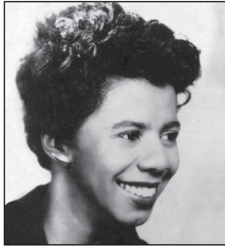
Hansberry's short career produced one of the theatre's most enduring dramas.

Every year, the HCASC Program Advisory Committee selects noteworthy African Americans to represent the round robin divisions. For 2009, literary light and playwright Lorraine Hansberry will represent the Black Division, while inventor extraordinaire, Elijah McCoy, will represent the Green Division.