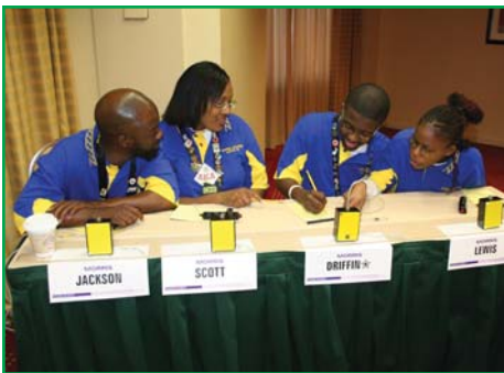
Looking like a team can help you play better as a team.

OPENING DINNER: The Opening Dinner is also a dressy occasion. Business attire (suits or jacket and tie) is appropriate for men. For the ladies, pantsuits or business skirt combinations are acceptable. Simple and elegant are words to keep in mind.