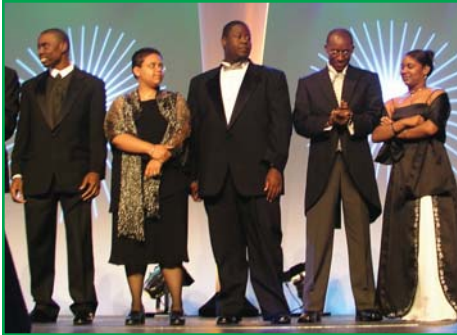
The 20th Year Closing Banquet is a time to look your Black Tie best.

The 20th Annual Celebration is a special occasion and black tie attire is required for the Closing Banquet. Men wear tuxedos, women wear cocktail, long dresses or dressy evening separates.