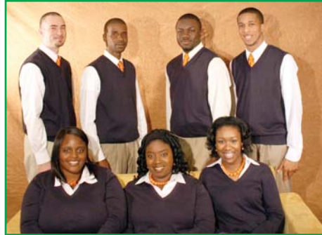
Nothing beats a snappy yearbook team photo. Coordinated looks are great!

in the game rooms, but are appropriate for evenings in the Student Union. Teams are encouraged to bring at least one coordinated outfit to reinforce team spirit.