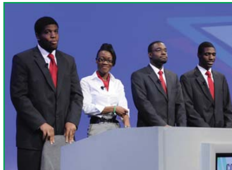
More teams will play on the "big stage" this year. Plan (and pack) accordingly.

YEARBOOK PHOTOS: Teams look great when dressed uniformly for these shots. Remember to smile!